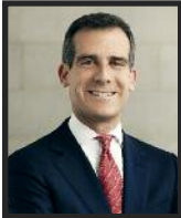
Eric Garcetti Mayor